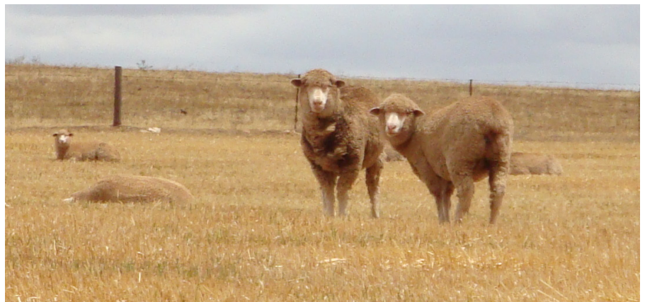
Top 20% nationally by return on equity

We refer to this as the profit driver framework. Whole-of-business performance will be compromised, at some point in time, without appropriate attention and consideration to all four of these primary profit drivers.