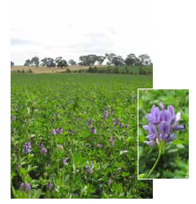
Lucerne provides quality forage over spring, summer and autumn