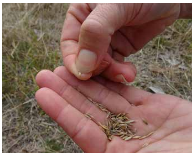
Checking if seed has ripened by squeezing the seed between your fingers.

Graze down to about 1,000kg/ha before the autumn break. This is equivalent to about one to two handfuls of dry loose material in 0.1m 2 (31 by 31cm quadrat).