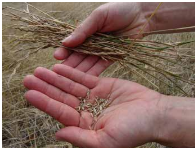
Demonstration of rubbing seed head (left) and inspecting seed in hand.

Maximising seed fall: Natural seed fall from the reproductive tiller requires the seed heads to become brittle. This may not occur for several weeks after ripening. To assist this process, the seed head can be disturbed to enhance seed fall.