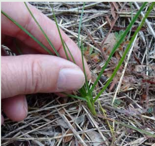
Gently pull seedlings to check anchorage.

To determine if the seedlings are well anchored and will not pull out when grazed, gently pinch the seedling between your finger and thumb and twist while pulling upwards. Well-anchored seedlings will offer some resistance and will not pull out easily.