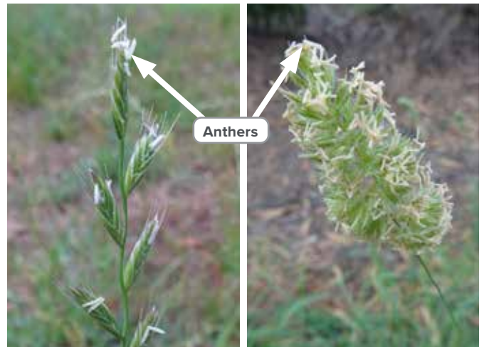
Flowering perennial ryegrass (left) and cocksfoot.

Time of flowering is cultivar and season-dependent, but typically occurs around mid to late November with seed ripening usually finished by early January. To identify flowering, inspect the seed heads and look for the appearance of anthers (flowers) on the plant.