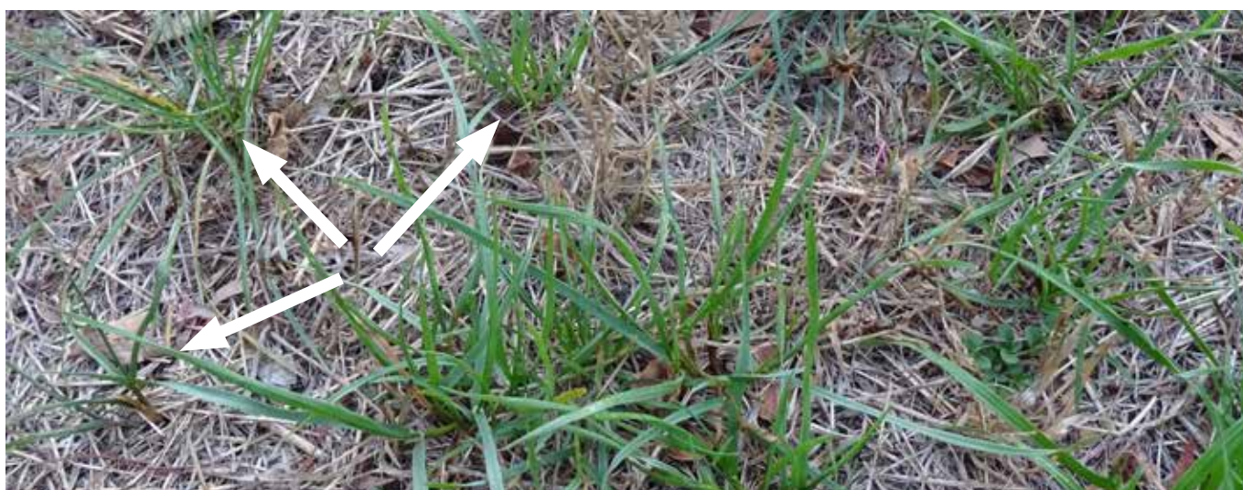
Recruited perennial ryegrass seedlings in amongst established plants.