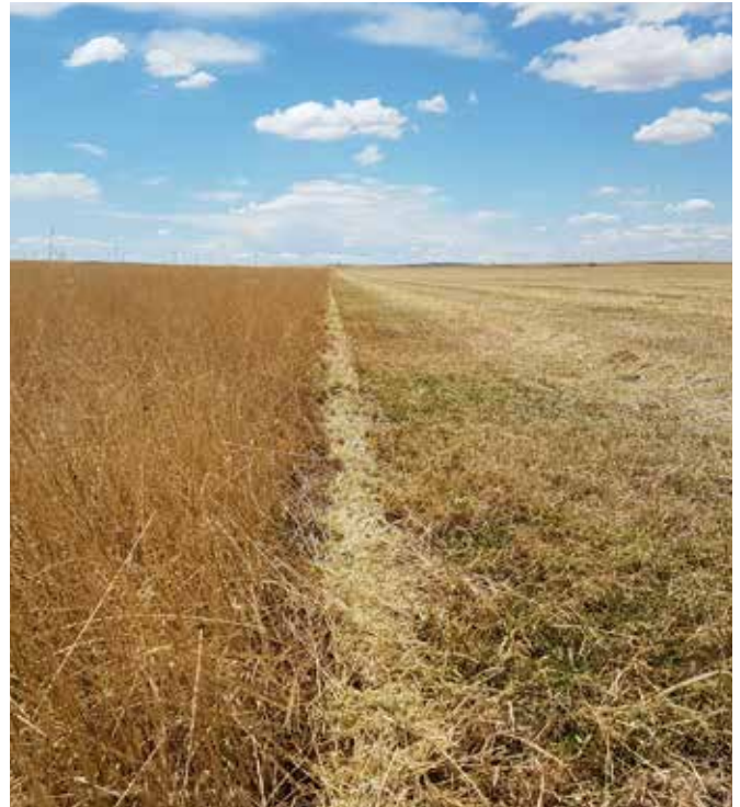
Slashing seed heads to bring seed to ground after ripening.

* Results based on crop seed production of 1.3t/ha perennial ryegrass and 0.5t/ha cocksfoot. In a mixed poor perennial pasture, it is estimated that seed yields could be approximately 10%. One kilogram of perennial ryegrass seed equals 320 seeds/m 2 and one kilogram of cocksfoot is 760 seeds/m 2 .