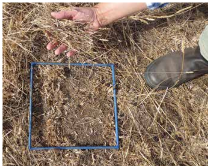
One handful of loose litter scraped up within 31cm square quadrat will allow seed germination.