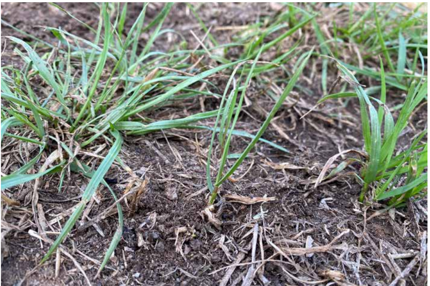
Recruited perennial ryegrass seedling in amongst established plants.

There are a number of ways producers can encourage seedling recruitment in their pastures and here we look at how seedling recruitment can be managed.