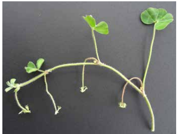
A sub-clover runner showing maturing and burrs forming.

NSW Department of Primary Industries 2018b, Part F – Choosing the right sub-clover variety , NSW Department of Primary Industries. [Online] Available at dpi.nsw.gov.au and search 'choosing the right sub-clover' (verified 1 September 2019)