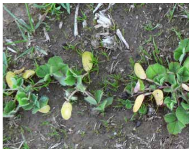
Sub-clover showing cotyledons dying 6–8 weeks after germination.

The seedling becomes less vulnerable to grazing after the appearance of the spade leaves because the seed stem (hypocotyl) is drawn below the soil surface, forming a tap root and anchoring the plant more securely. The growing point also retracts below grazing height.