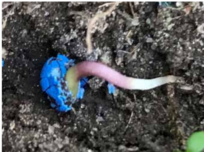
New root emerging from germinating sub-clover seed (blue coating is seed treatment).

Seed germination occurs once hardseededness has broken down, soil temperature is below 26°C and cumulative rainfall events are above 20mm. The dry seed absorbs moisture, initially producing a root called a radicle.