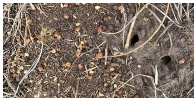
Ant predation of surface seed by stripping seed from burr to take down into nests

Choosing cultivars that best suit the soil type, grazing approach and time of flowering to match growing season length is critical to the long-term success of a sub-clover pasture. 3