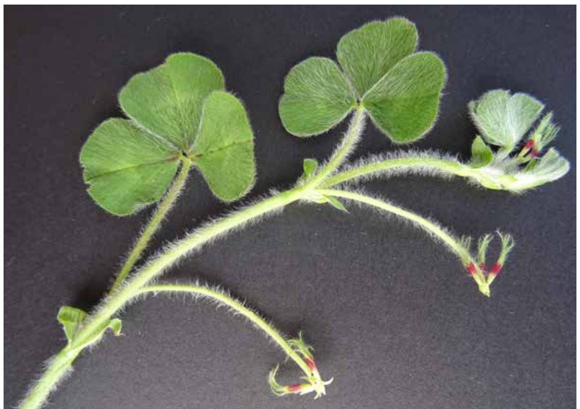
A sub-clover runner with the newest leaf emerging from the end of the runner and flowers at the intersection of each leaf.

Leaf production lessens once flowers appear on the runner, as energy is redirected into filling the seed rather than growing leaves.