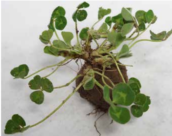
Sub-clover rosette, 15cm in diameter, with six branches and many leaves visible.

Sub-clover grows from a central point, producing branches that commonly grow horizontal to the ground. Along each branch, between 8–16 leaves are produced, which gives the plants a rosette appearance.