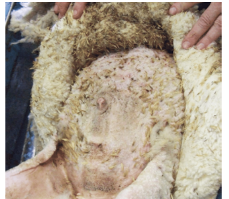
Barley grass seed has entered the gland under the sheep's eye and contaminated the wool and, potentially, the carcass.