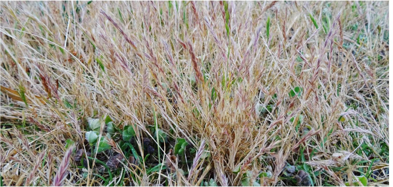
Silver grass shortens seasonal production by flowering earlier than improved perennial grasses.