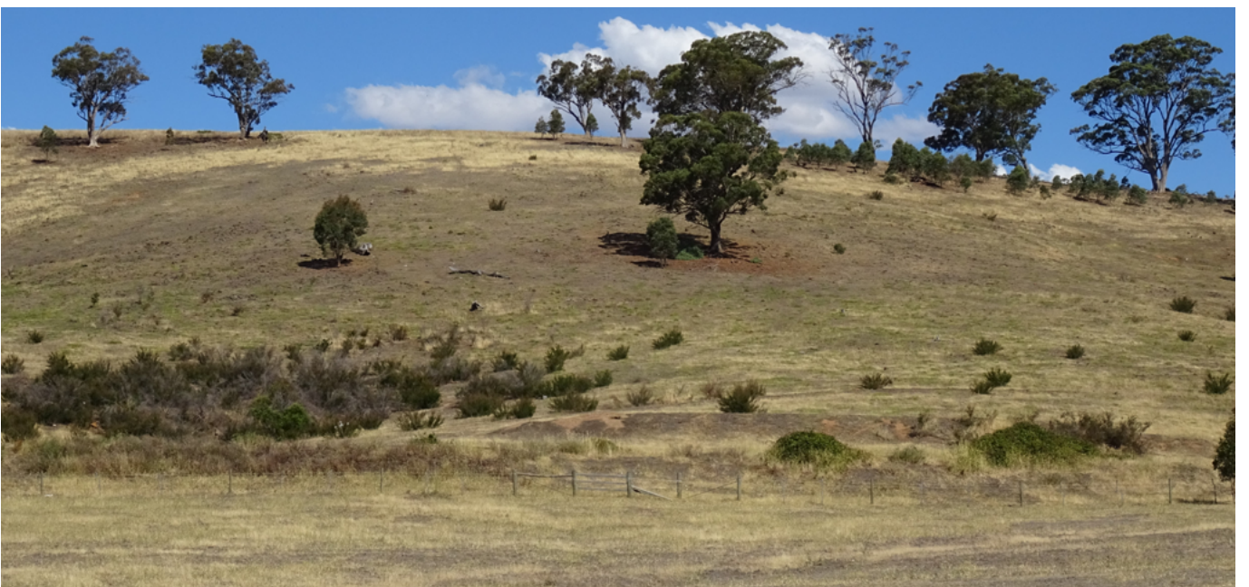
Capeweed finishes early to leave bare hills.