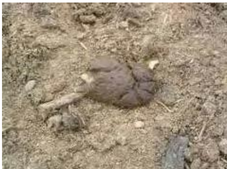
Figure 1-3 - Faecal consistency score 3 - porridge-like consistency; forms a soft pile