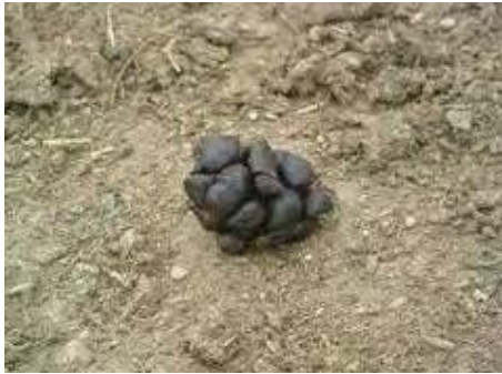
Figure 1-1 – Faecal consistency score 1 – hard pellets

Faecal consistency can be estimated on a scale of 1 to 5, where hard pellets would be considered 1, and fluid faeces are a 5. Monitoring faecal consistency is an important tool in identifying and managing acidosis and other health and nutritional disorders.