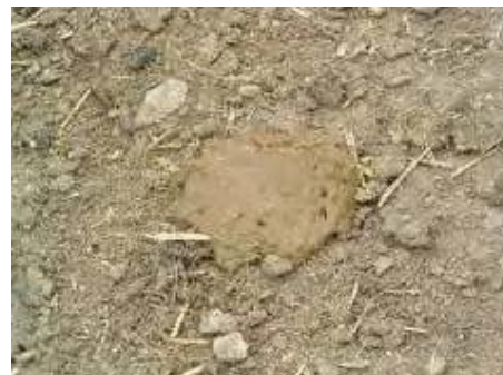
Figure 1-5 - Faecal consistency score 5 - very liquid manure; includes diarrhoea