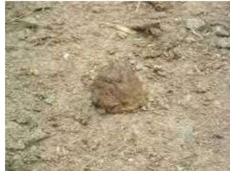
Figure 1-4 - Faecal consistency score 4 - runny manure; forms a loose pile