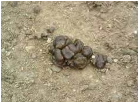
Figure 1-2 - Faecal consistency score 2 – thick manure