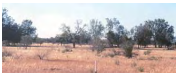
Figure 8. This series of photographs show the results from a management burn to control encroaching INS seedlings. While they are less than 50 cm high, fire is an effective tool in limiting their establishment (Figure 4).