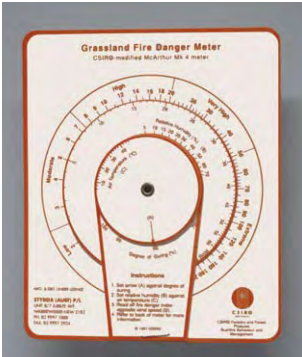
Figure 5. One of the McArthur Grassland Fire Danger Meters available to help landholders carry out management burns.