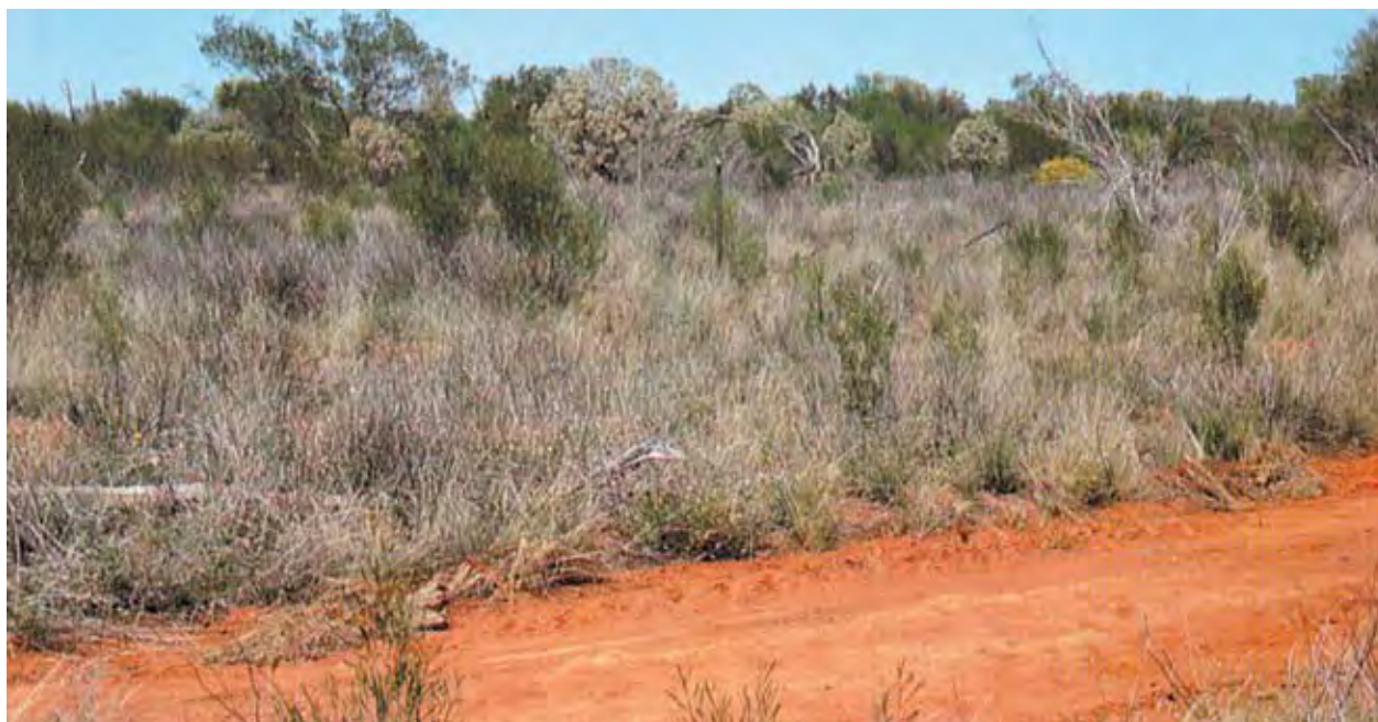
Figure 1. An ideal situation for a management burn – many young shrubs, some older shrubs and a very good fuel load to carry the fire.

The most important factor to consider when introducing management burning onto a property is how the burning program will fit into the overall management plan for that property. Successful pastoral management must include livestock and