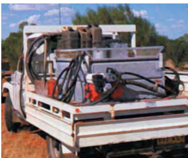
Figure 7. A well-equipped fire unit with a tank and reliable pump unit, hoses and adjustable nozzles, drip torches and UHF radio.