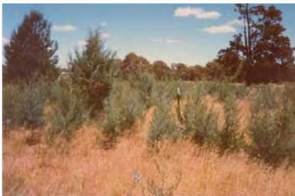
Figure 6. This area needs a management burn before plants mature and set seed.