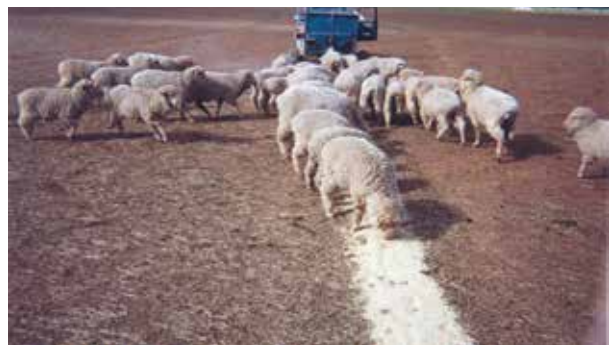
Destocking rather than feeding may be all or part of your drought fodder reserve strategy

Sheep producers who already have a cropping enterprise will generally have less difficulty in managing fodder reserves, as they are already trading in the grains market, dealing with storage issues and generally have more machinery to facilitate silage or hay production as well. Sheep producers with no cropping enterprise will need to consider machinery and management ability in particular when assessing their options.