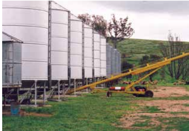
The key to capitalising on low grain prices is having a well prepared storage area.

Fortunately for each of them, the next drought does not occur for seven years. The following outcomes for each sheep producer occur. In each case it is assumed an interest rate of eight per cent, on-farm storage losses of 0.5 per cent per year for grain and two per cent per year for silage. There is on-farm storage for approximately 100-110 tonnes of grain.