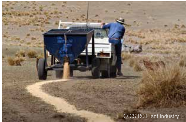
Silage is slower and more expensive to feed out compared to grain.

Storing grain remains a simple and effective system, provided the price variation which has occurred historically continues into the future. Buying or retaining grain worth under $150/t is likely to result in lower grain costs than retaining the cash and buying during a drought, provided on-farm storage is adequate. However, if grain prices remain high and price variation reduces,