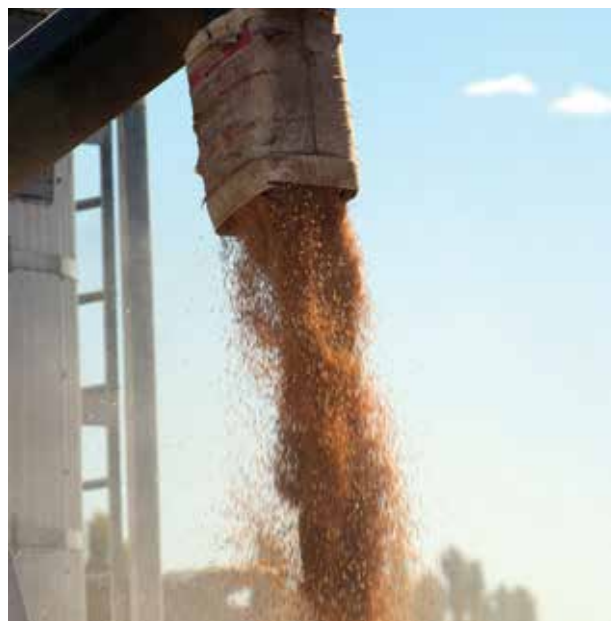
Fodder supply risk is an emerging issue for the wool industry

Therefore, a simple financial provision for drought by a sheep producers may not be sufficient if sheep producers are unable to access fodder when required. In addition, such shortages in domestic supply are likely to further exacerbate price rises during droughts.