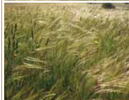
Chilean needle grass