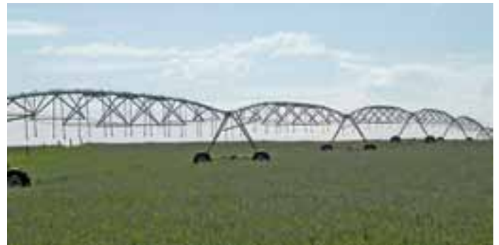
An irrigated pasture system is an option to minimise the risk of grass seed contamination.