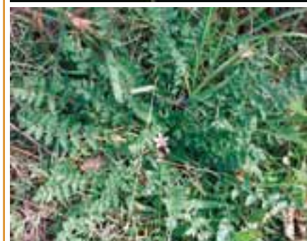
Erodium spp. (Storksbill)