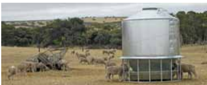
Short term feedlotting can be a viable option to carry lambs through the grass seed risk period until clean paddock feed becomes available.

Your management strategy should focus on eliminating the core of the problem – the weeds. This can be achieved through the strategic use of seed reduction with the support of short-term and avoidance strategies in the interim.