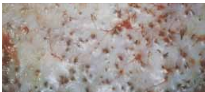
New season sucker lamb skins can be discounted by as much as 50% for grass seed penetration and vegetable matter contamination of the wool.