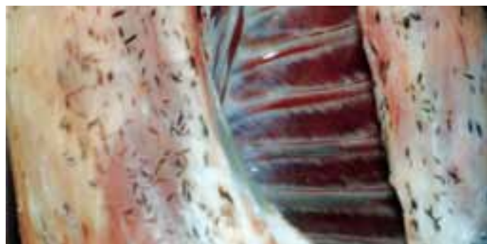
Carcass contaminated with small black seed heads

Most processors will provide a similar feedback report to producers whenever a grass seed penalty is given on a consignment of lambs. Such a report will often be accompanied by photographs of the seedy carcasses.