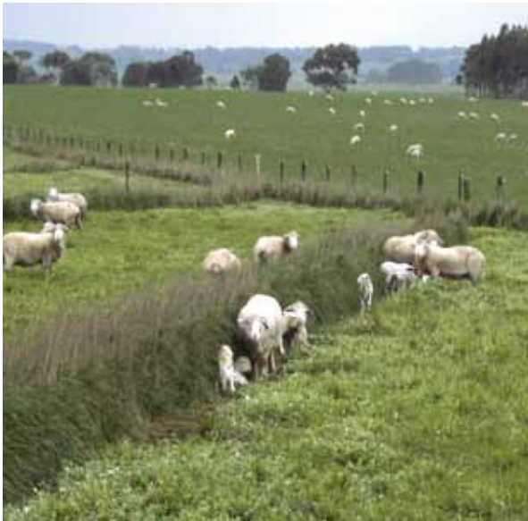
Ewes and lambs sheltering in a perennial grass hedge