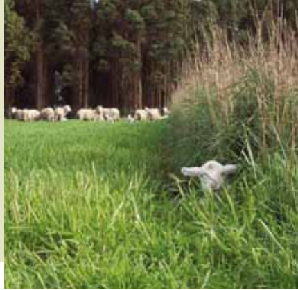
Young lamb sheltering in a tall wheatgrass hedge