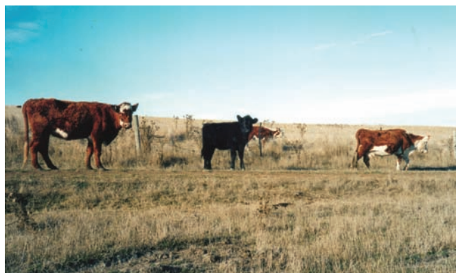
Ill-thrifty, scouring cattle, too nervy to muster/wean. As in the previous photograph, the concentration of endophyte produced toxins was high in the ryegrass and present in the faeces.