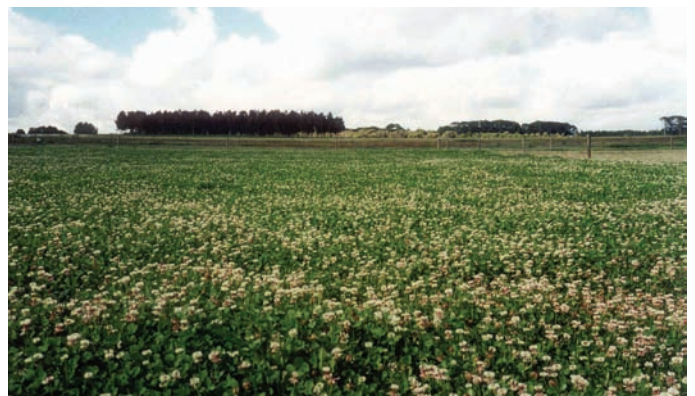
Other alternative pastures suitable for summer/autumn grazing include Mink white clover (above) and Tonic plantain (over the page).

Consideration should also be given to the use of alternative permanent pasture species such as lucerne, phalaris (although it can occasionally cause a different type of staggers), tall fescue, cocksfoot, chicory and plantain which will not cause PRGT.