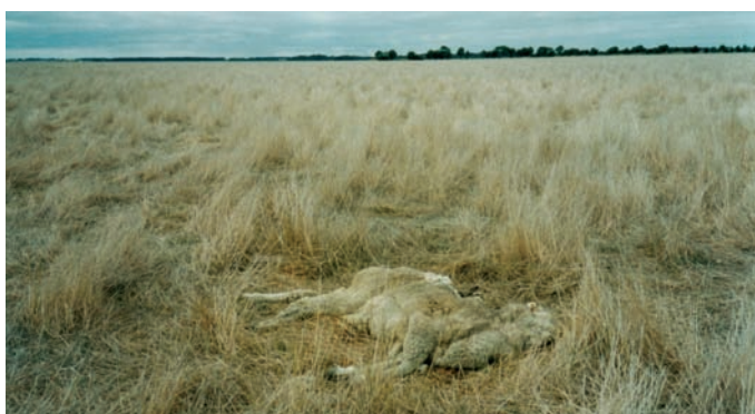
Sheep can die on abundant late growth/aftermath ryegrass.

Mildly affected stock develop tremors which are exaggerated by external stimuli. As the toxicosis worsens, animals lose coordination, develop a stiff gait and arched back and lose control of their direction of movement. They may collapse, have convulsions, and be unable to rise, leaving them susceptible to dehydration, starvation and attack by predators.