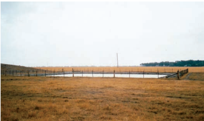
Dam fenced to prevent drowning of affected stock.